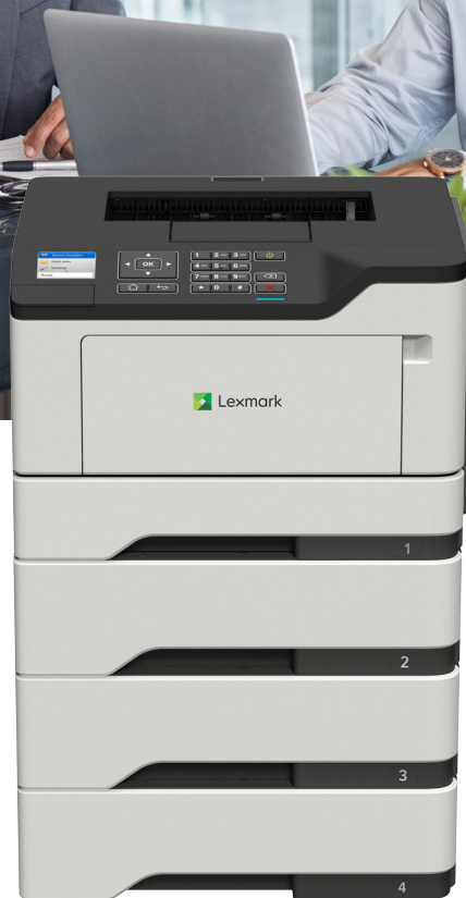
M1246 with optional trays