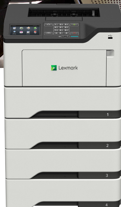
M3250 with optional trays