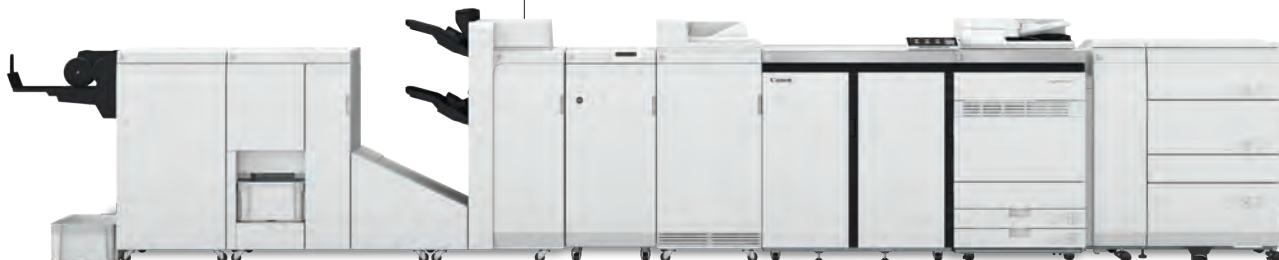
imagePRESS VI000 shown with optional accessories.