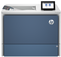
HP Color LaserJet Enterprise 5700dn Printer

This printer is intended to work only with cartridges that have a new or reused HP chip, and it uses dynamic security measures to block cartridges using a non-HP chip. Periodic firmware updates will maintain the effectiveness of these measures and block cartridges that previously worked. A reused HP chip enables the use of reused, remanufactured, and refilled cartridges. More at: http://www.hp.com/learn/ds